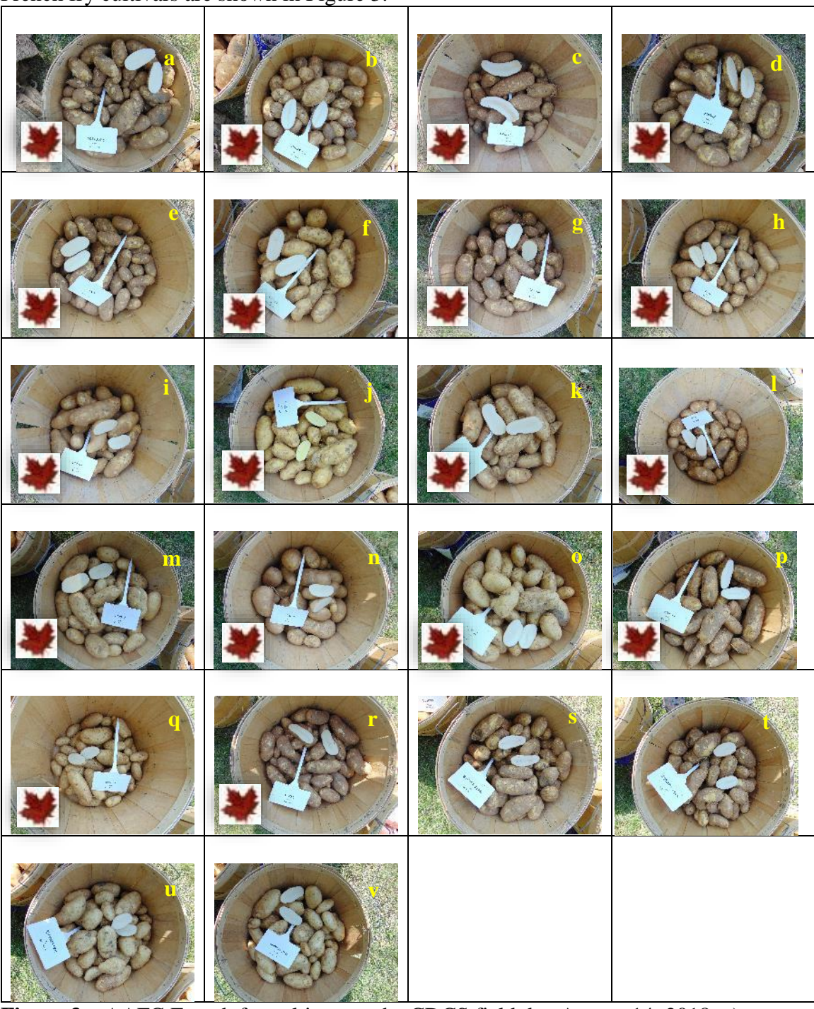
Figure 3. AAFC French fry cultivars at the CDCS field day August 14, 2018: a) CV011010-2, b) CV011238-1, c) CV08212-1, d) F14002, e) F14003, f) F14005, g) F14008, h) F14010, i) F14011, j) F14015, k) F14016, l) F14017, m) F14018, n) F14020, o) F14021, p) F14022, q) F14023, r) F14057, s) Russet Burbank E, t) Russet Burbank W, u) Shepody E, and v) Shepody W.

Sample hills of each cultivar were dug for a field day August 14, 2018. Photos of the French fry cultivars are shown in Figure 3.