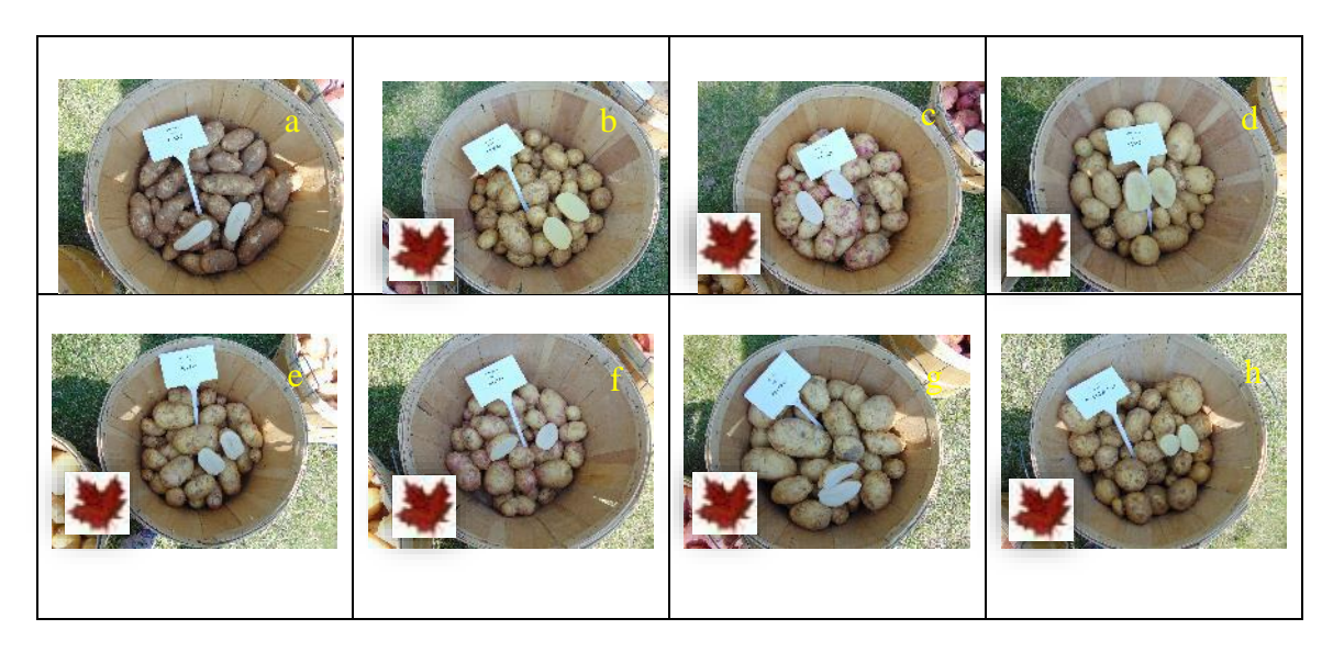
Figure 4. AAFC yellow/white fresh market cultivars at the CDCS field day August 24, 2017: a) F14057, b) F14067, c) F14068, d) F14126, e) F14128, f) F14132, g) Kennebec, and h) Yukon Gold East.

Sample hills of each cultivar were dug for a field day August 14, 2018. Photos of the yellow/white fresh market cultivars are shown in Figure 4.