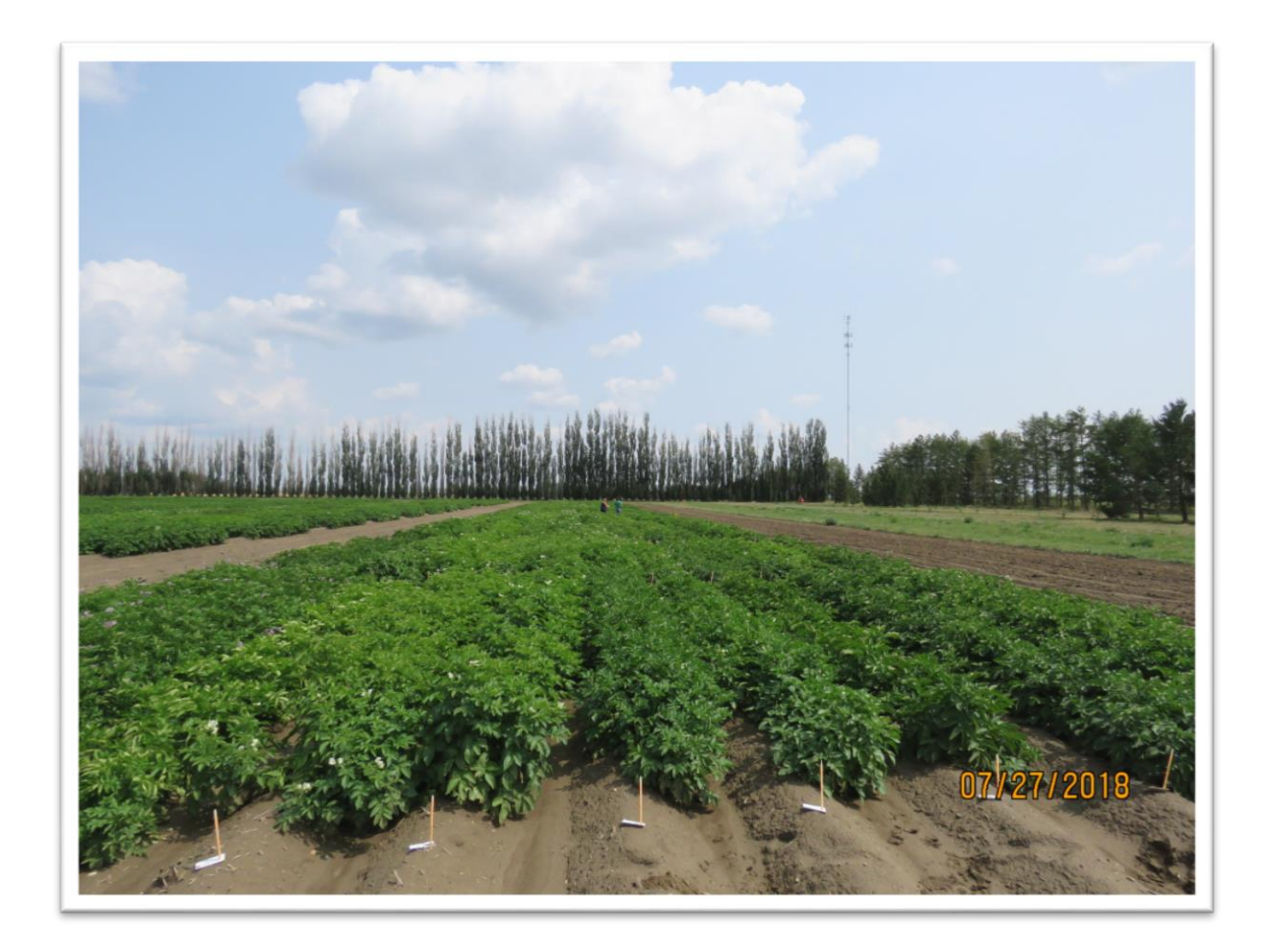
Figure 1: Variety evaluation trial at CDCS in Brooks, AB July 27, 2018.

Reglone was applied (1.0 L/ac) August 23, 2018. Potatoes were harvested September 5 and 6 using a 1-row Grimme harvester.