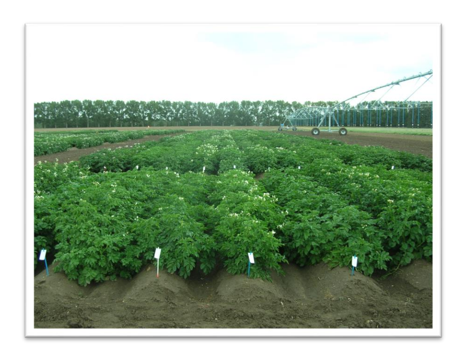
Figure 1: Variety evaluation trial at CDCS in Brooks, AB July 27, 2015.

Reglone was applied (1.0 L/ac) September 4 and again September 11. Potatoes were harvested September 21 and 23 using a 1-row Grimme harvester.