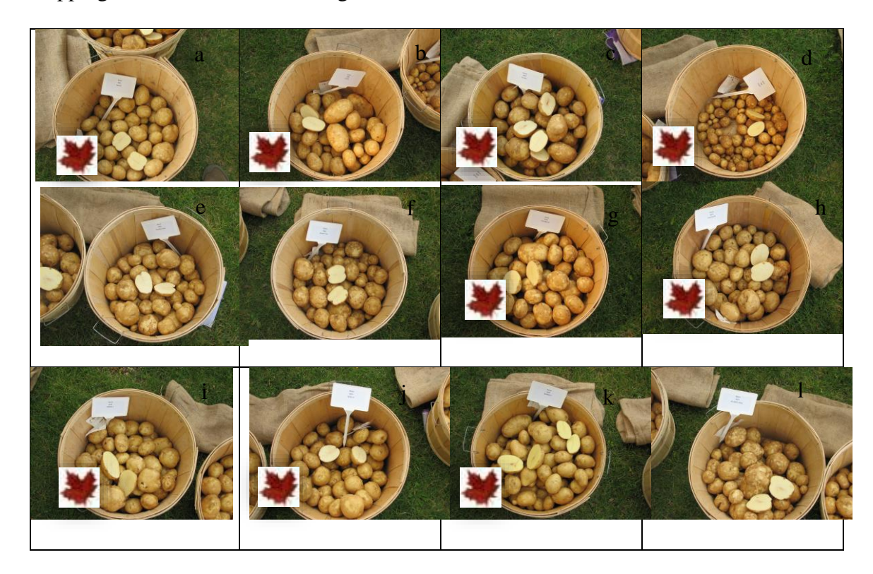
Figure 2. AAFC chipping cultivars at the CDCS field day August 27, 2015: a) F11011, b) F11012, c) F11013, d) F11017, e) Snowden East, f) Atlantic East, g) FV15568-30, h) FV15732-09, i) V08053-1, j) V1351-3, k) WV9890-2, l) Atlantic W.

Sample hills of each cultivar were dug for a field day August 27, 2015. Photos of the chipping cultivars are shown in Figure 2.