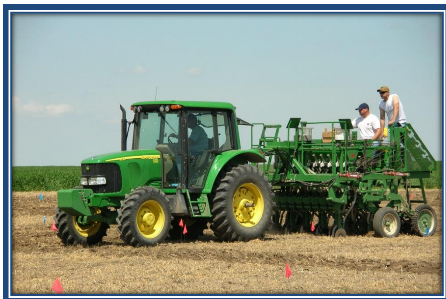
Planting green manure crops 2007.

In 2007, green manure crops were planted in two commercial southern Alberta fields on July 11 (Field D) and July 19 (Field C) (Table 2). Finding co-operators for the 2007-2008 year was challenging. Annual ryegrass and California bluebell were used in place of the oilseed radish and oriental mustard in both fields due to the high density of hybrid canola production in southern Alberta. An oat-pea-vetch mixture replaced the woolly pod vetch in 2007. The trial sites were located under centre pivot irrigation in commercial cereal fields. In Field C, the trial area was sprayed out with glyphosate and worked prior to planting the green manure crops. We removed standing crop and planted in stubble in Field D.