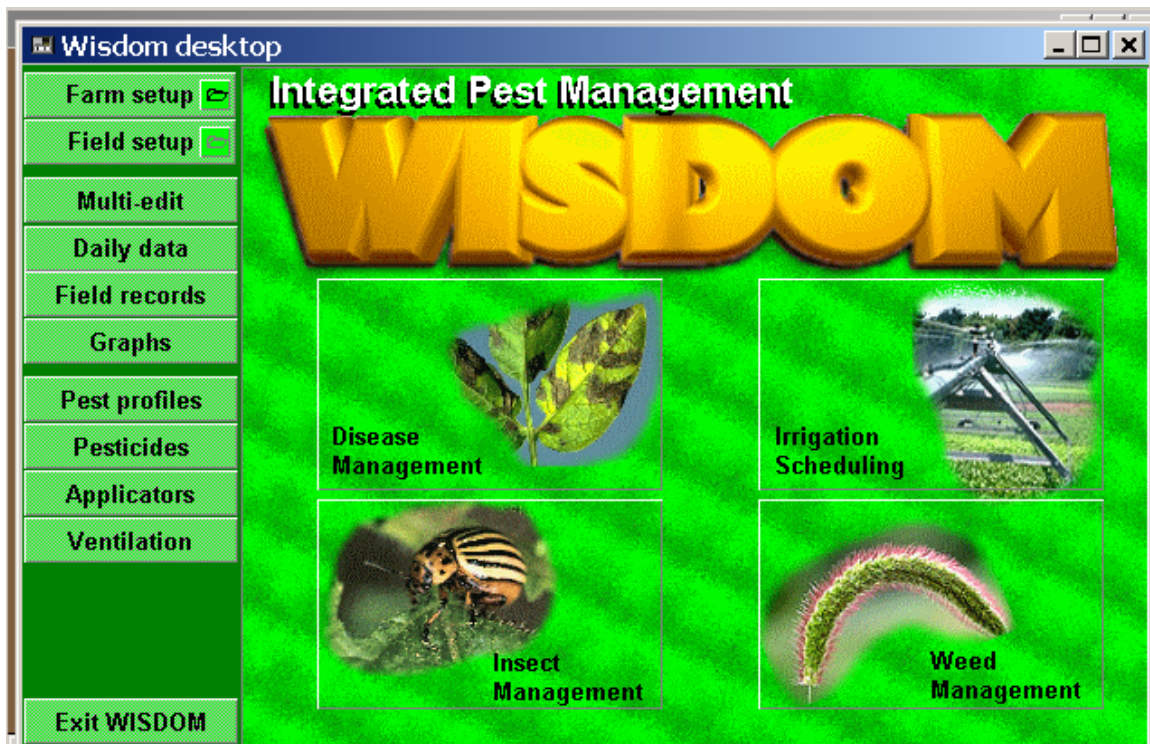
Fig. 2. User interface for the WISDOM model.

WISDOM. The WISDOM model was developed by the University of Wisconsin Extension in Madison, Wisconsin, as a four module Integrated Pest Management and Irrigation Scheduling decision support tool (Stevenson, 1993). Advice on timing and application rate (low, medium, and high) of fungicides for both early blight ( Alternaria solani ) and late blight ( Phytophthora infestans ) disease development on potatoes is contained in the disease management module. Insect management, weed management, and irrigation scheduling are the other modules contained within the WISDOM model (Fig. 2).